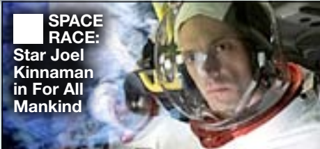
SPACE RACE: Star Joel Kinnaman in For All Mankind