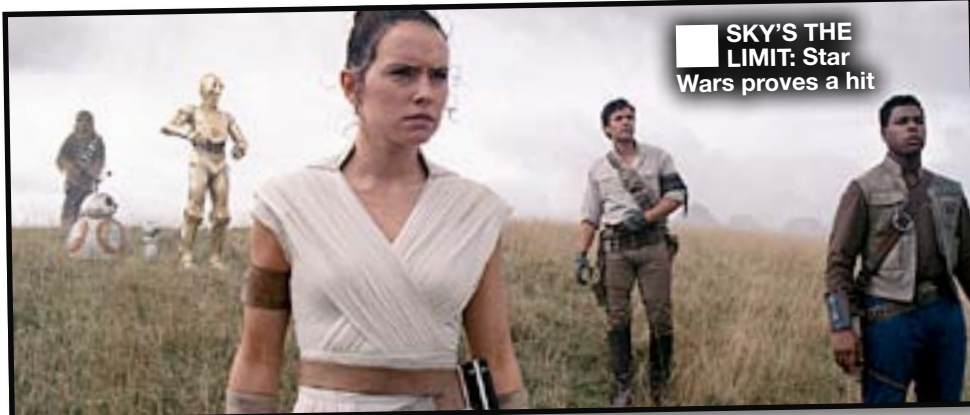
SKY'S THE LIMIT: Star Wars proves a hit

YOUTUBE sensation Rapman's gangland drama caused controversy when violence spilled into the foyers of the multiplexes.